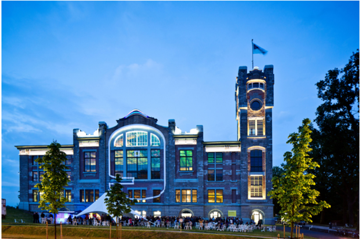
Venue of Manifesta 9, the former coal mine of Waterschei, Genk.